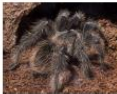
Brazilian salmon tarantula