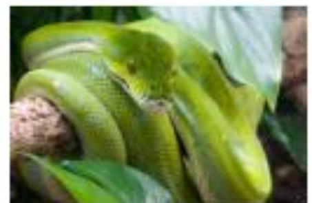
Green tree python