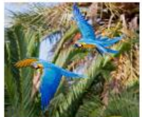
Blue and yellow macaw