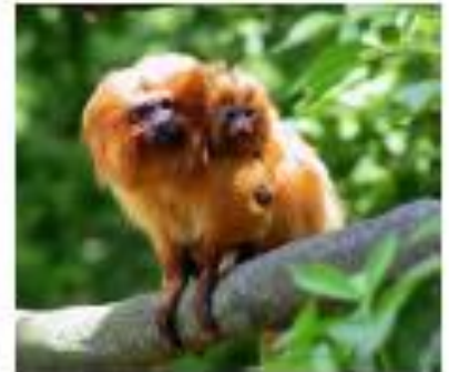
Golden lion tamarin